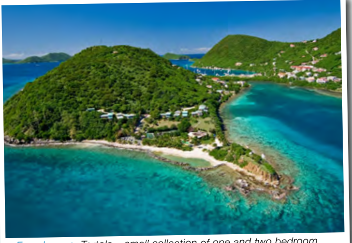
Frenchmans, Tortola – small collection of one and two bedroom villas with pool, tennis courts and restaurant.

There is a good selection of water sports on the beach and you can hire a little motor boat and take yourself over to Jost van Dyke to visit the famous Soggy Dollar Bar on yet another stunning white sand